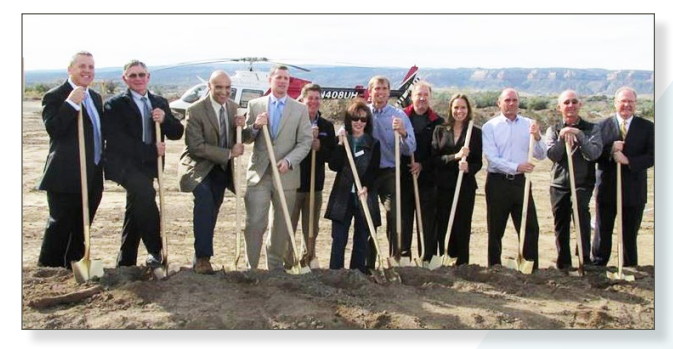
The groundbreaking was held on October 15, 2014.