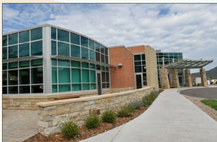
Aspen Valley Hospital today.

Aspen Valley Hospital is celebrating its 125th year of providing service to Aspen and the greater Roaring Fork Valley. In 1889, spearheaded by community need and with the Citizens' Hospital Committee of Pitkin County leading the charge, an effort to construct a “state-of-the-art” hospital was set in motion. With significant initial gifts and an intensive campaign based on the philosophy that “..no man who has employment should fail to give a day’s wages”, sufficient funds were raised to construct the first hospital in Aspen, then known as the Citizens' Hospital.