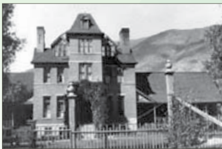
The first hospital in Aspen, known as the Citizens' Hospital, opened its doors in 1891.