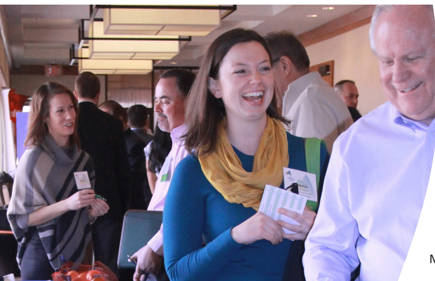
WHA members at WHAAS 2015.