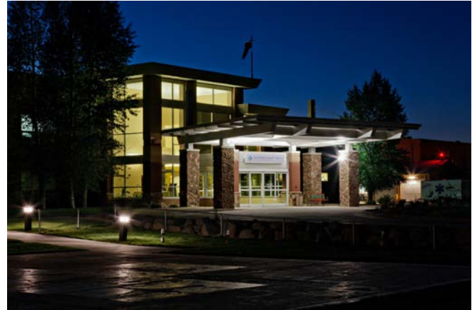
Gunnison Valley Health